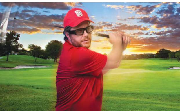
Provides mapping and distance to hole data

“hands free” digital world, providing unprecedented access to location connected information, data collection and more. The private, see thru, full color, bright, high resolution big screen performs both indoors or in sunlight. The Vuzix Blade 3000 – your very own wearable, mobile personal computer.