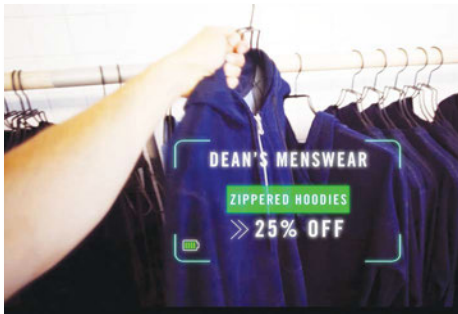
Shop for specials with location-aware access