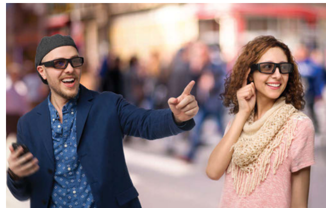
Access to location aware travel information

View the Future Through Vuzix' Blade 3000 Waveguide Optics