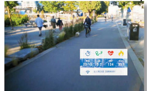
Monitor your vital signs while jogging or exercising